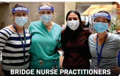
BRIDGE NURSE PRACTITIONERS

The program focuses on bridging the gap between leaving the hospital and going home while caring for the most fragile infants. BRIDGE Nurse Practitioners visit families in their homes to help monitor the infants' care, growth and development, as well as connect the family to vital community resources. With support from Sunlight Giving and the Foundation, the program has continued their services throughout the pandemic, providing their care safely while offering a sense of normalcy to families during a time where they face additional barriers.