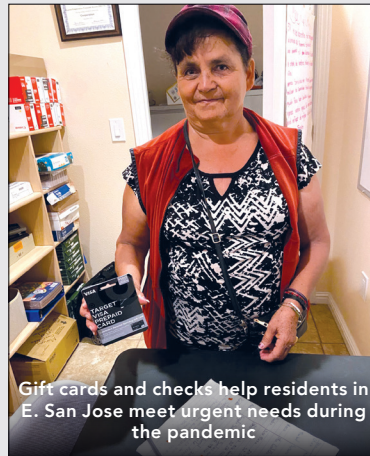
Gift cards and checks help residents in E. San Jose meet urgent needs during the pandemic

ESJ PEACE has worked to provide families and individuals, predominantly essential workers, with checks and gift cards to help pay for food, gas, and rent. Addressing critical needs requires a broad approach and so ESJ PEACE has worked collaboratively with local government agencies, non-profits and community-based organizations to meet the needs of prevention, testing, medical care, temporary housing, and financial support strategies. We are proud to be a part of work that is committed to improving outcomes for this high-risk community especially during the pandemic.