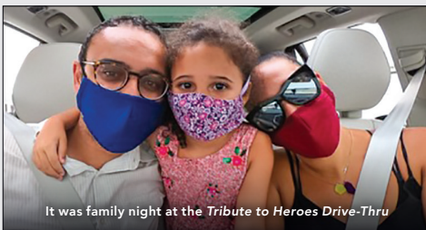
It was family night at the Tribute to Heroes Drive-Thru