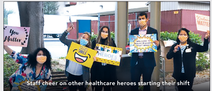
Staff cheer on other healthcare heroes starting their shift